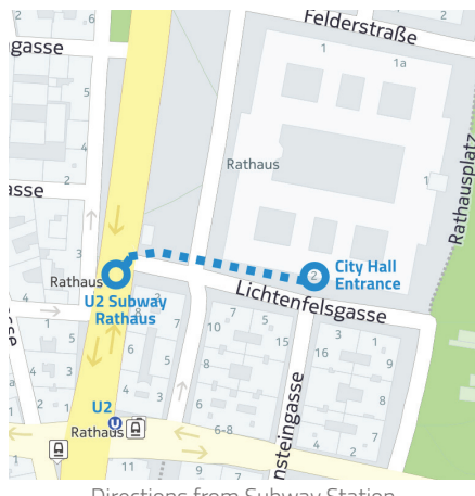
Directions from Subway Station "Rathaus" to City Hall