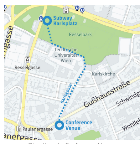
Directions to Conference Venue

Elektrotechnisches Institut Gußhausstraße 29 1040 Vienna, Austria