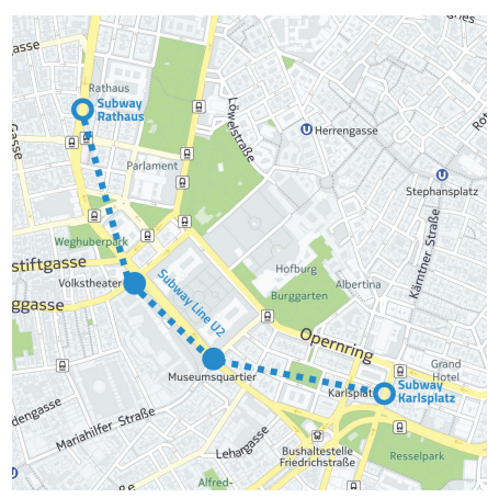
Directions to City Hall

You can reach City Hall (Rathaus), where the Mayor's Reception on Wednesday will be held, by foot (approx. 30 minutes) or by taking the subway U2 from Karlsplatz to Rathaus (direction Stadion, approx. 15 minutes).